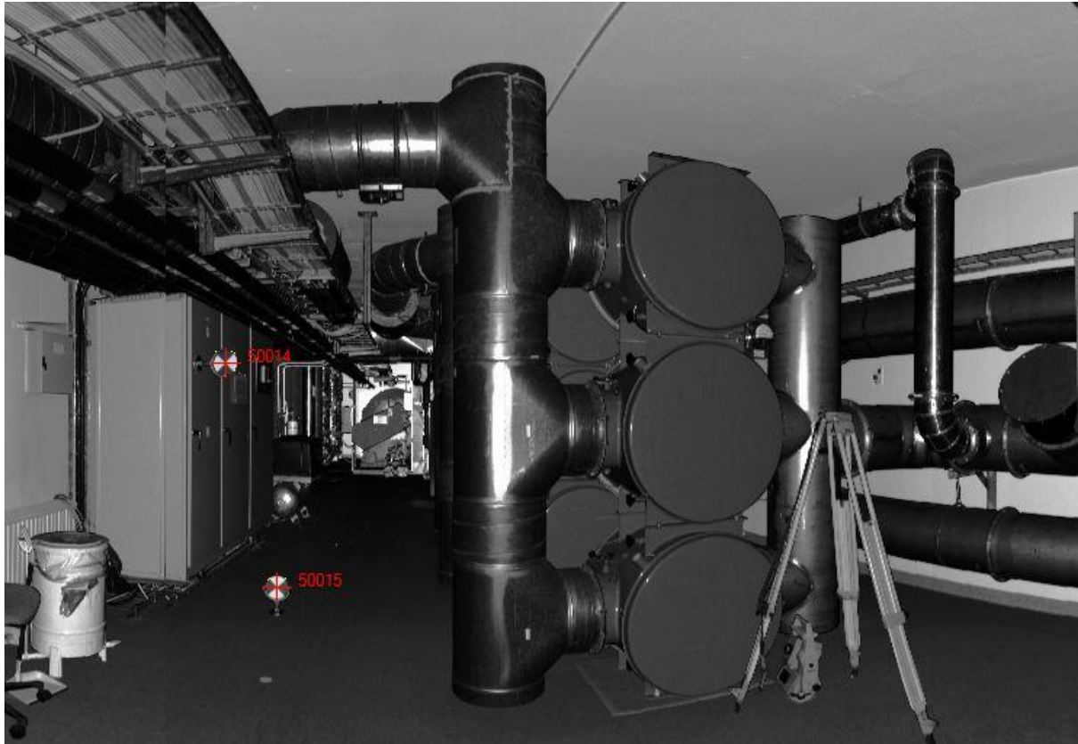
Figure 2. 3D Laser image of a part on the top floor (HM building)

Combining the position coordinates and the radiological measurements, the contamination situation of a building can be visualised in the scanned 3D model with different symbols in colours and sizes, see Figure 3.